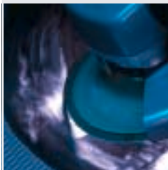
Resin Fibre Disc

ideal for blending, finishing and cleaning on contoured surfaces